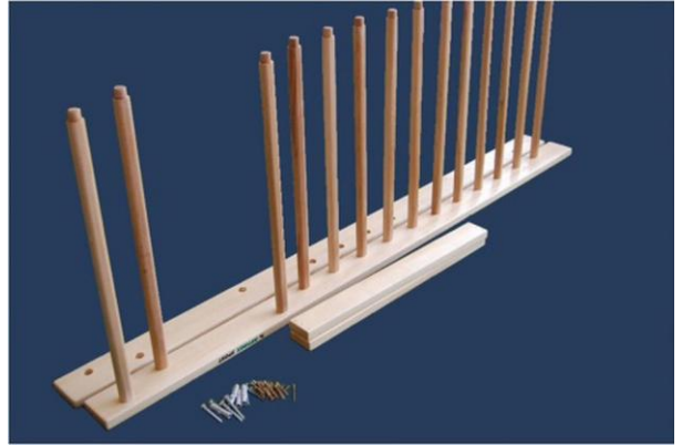
2. Fit the rungs in a side rail; align the flat side of the rung with the long dimension. Use a rubber mallet to tap the rungs in place if necessary.