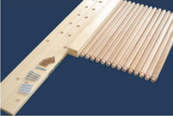
1. Typical Kit Contents