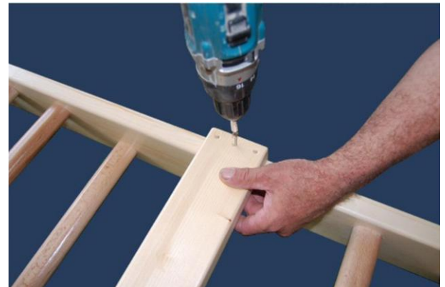
6. Use the 3" screws to attach the wall bars into the predrilled holes. Secure the unit to the wall with the lag bolts provided. Test the unit for stability before use.