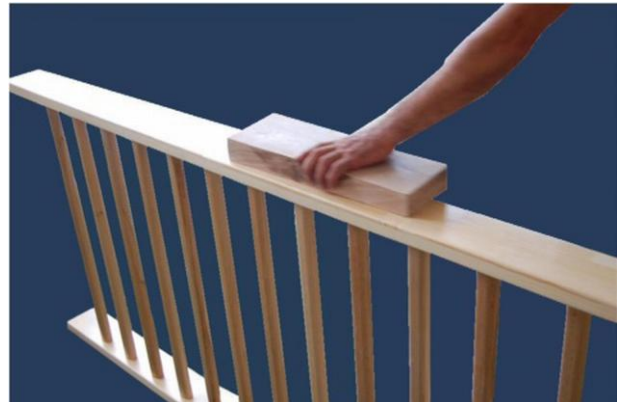
4. Use a wood block and rubber mallet if necessary to fully seat rungs.