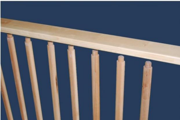
3. Fit the second rail. Start at one end, and progressively engage rungs until all are seated.