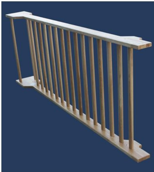
3. Fit the second rail. Start at one end, and progressively engage rungs until all are seated